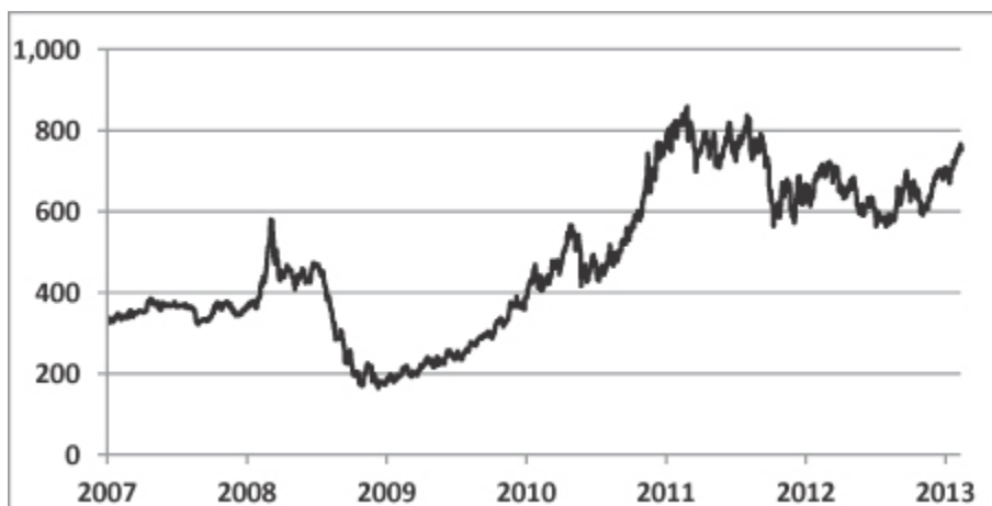
Palladium Price (US$/Troy oz)

During 2012, the palladium price averaged US$640 per ounce, ranging from a low of US$556 to a high of US$719 per ounce. As of February 21, 2013, the palladium price was US$722 per ounce.